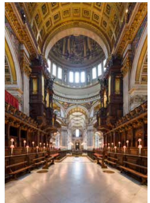
St. Paul's Cathedral Choir

St. Paul's Choir Residency at Truro Cathedral will be from July 25 to 31, 2022, and Evensong at St. Paul's Cathedral in London will be on Monday, August 1, 2022.