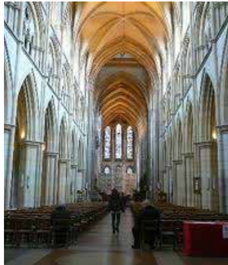
Truro Cathedral interior

Truro Cathedral also is famous for having been the location of the first ever Service of Christmas Lessons and Carols, devised in 1880, later made famous at King's College, Cambridge, and used all over the world, including for our own Christmas Eve services at St. Paul's.