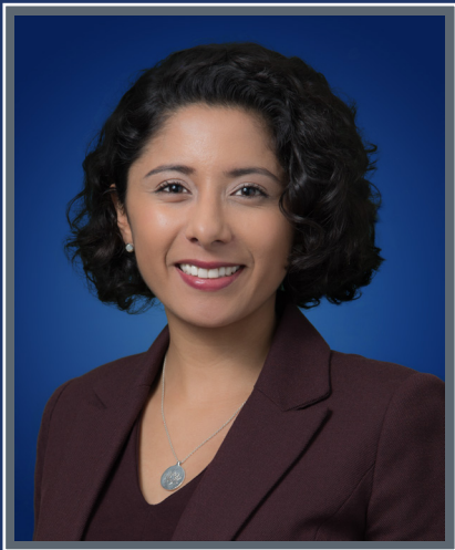
Harris County Judge Lina Hidalgo